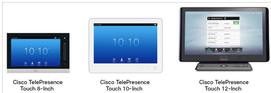
Figure 1. Cisco TelePresence Touch

Cisco TelePresence Touch devices feature a revolutionary user interface focused on people and how they communicate in one-on-one and group settings. Work environments today demand interactions that are distributed across communication mediums and vary with the changing context, contacts, and content. With Cisco TelePresence Touch devices, you can quickly and easily access the most common tasks in the context of your interaction. The innovative design allows effortless integration with the various forms of synchronous and asynchronous communication that are already part of the workflow.